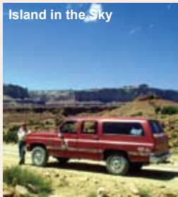
Island in the Sky

Cost Adults $120 + tax • Youth (16 & younger) $100 + tax • Includes lunch • Price does not include Park entrance fee.