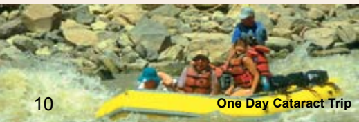
One Day Cataract Trip

Cost Adults $160 + tax • Youth (16) $140 + tax Includes lunch • Price does not include Park entrance fees.