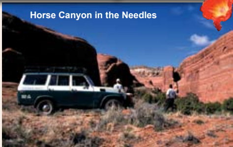
Horse Canyon in the Needles